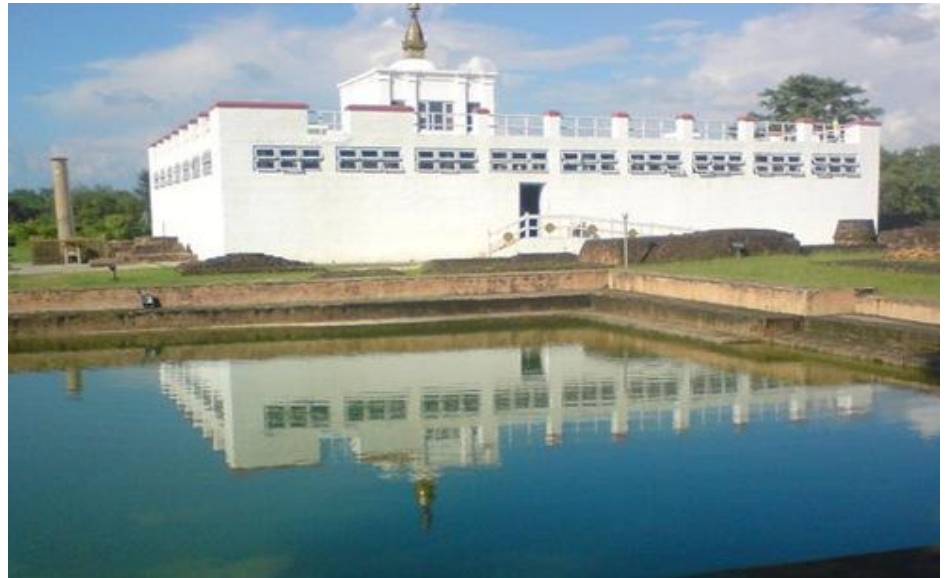
Supporting Visit Lumbini Year 2012